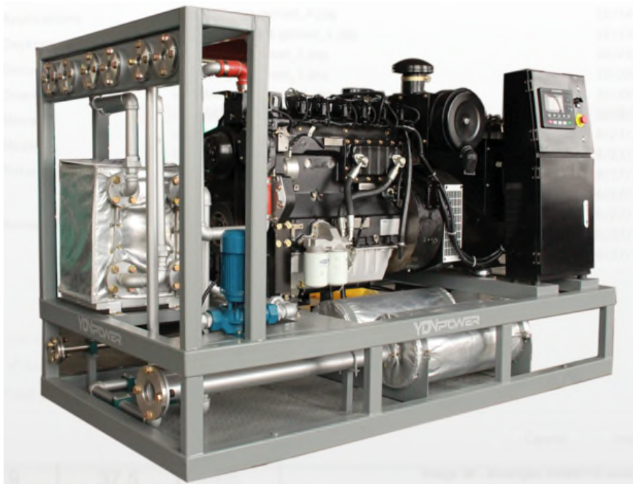
Image 3# - CHP heat recovery from water jacket, exhaust plus heat exchanger